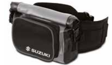
7 | DRY HIPBAG Waterproof hipbag made of welded tarpaulin, reflective details, adjustable waist belt. C 2.5 litres Part No. 990F0-DRYHB-002