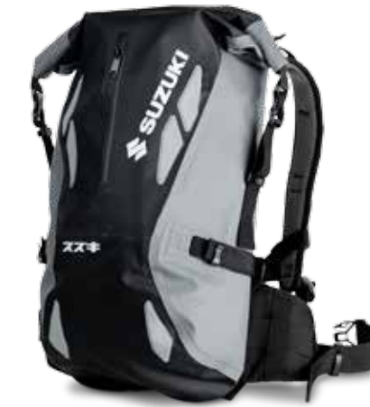
6 | DRY BACKPACK Waterproof backpack, anthracite/black, integrated padded laptop sleeve (up to 17" devices), additional outer pocket, environment-friendly TPU fabric, reflective material. H 66 cm/W 35 cm/D 14 cm/C 20 litres Part No. 990F0-DRYBP-000