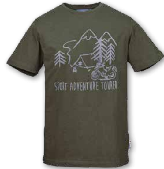
2 | SUZUKI SPORT ADVENTURE T-SHIRT Green adventure T-shirt with grey print, flamed jersey, 100% cotton. S/M/L/XL/XXL Part No. 990F0-HTS14-size