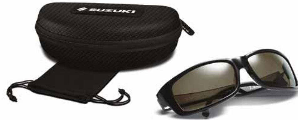
1 | SUNGLASSES Stylish and lightweight, with 100% UVA and UVB protection, made from acrylic with embossed Suzuki logo. Comes with EVA case and microfibre pouch. Part No. 990F0-MSUN3-000