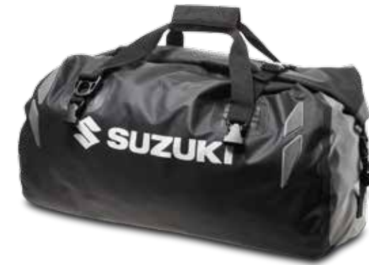
5 | DRY BAG Dry bag made of welded tarpaulin, reflective details, additional shoulder belt included. H 30 cm/W 30 cm/D 55 cm/ C 35 litres Part No. 990F0-DRYDB-002