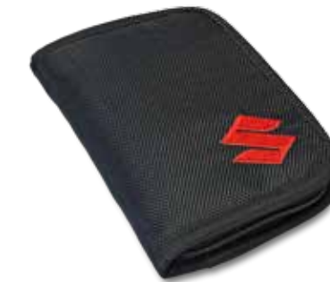
9 | WALLET Black full-zip wallet with embroidered Suzuki logo on front. Nylon fabric with lining. Hook for key fixation and coin zipper pocket inside. H 15 cm/W 10.5 cm/D 2 cm Part No. 990F0-MWAL1-000