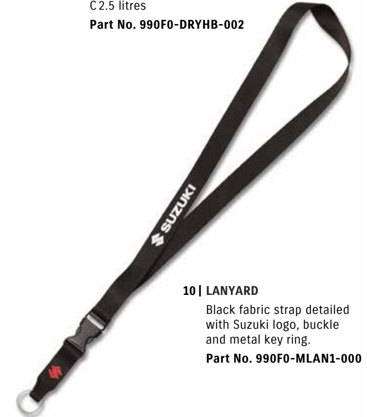
10 | LANYARD Black fabric strap detailed with Suzuki logo, buckle and metal key ring. Part No. 990F0-MLAN1-000