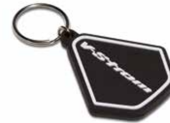
8 | V-STROM 1000 KEY RING Black and white, PVC. Part No. 990F0-DLKE1-KEY