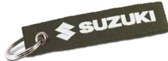
4 | SUZUKI SPORT ADVENTURE TOURER KEY RING Dark olive with white Suzuki logo textile key ring. Part No. 990F0-SATK1-000