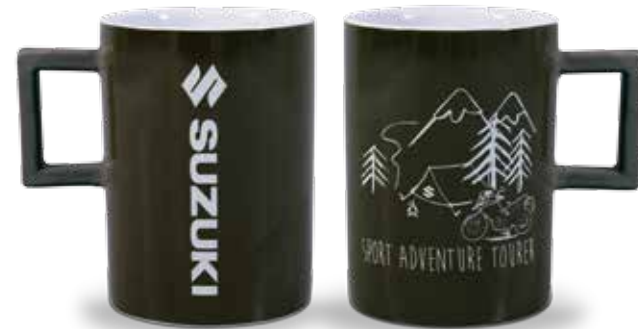
3 | SUZUKI SPORT ADVENTURE TOURER MUG Dark olive colour with white design elements, ceramic, suitable for microwave and dishwasher. Part No. 990F0-SATM1-000