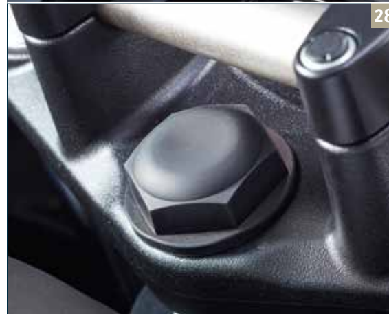
28 | RUBBER CAP Black rubber cap covering steering stem nut. Part No. 990D0-99074-A24