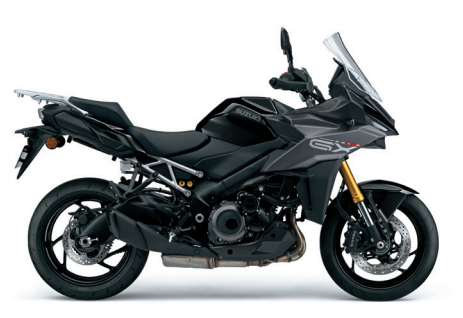
Glass Sparkle Black (YVB)