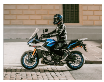
Suzuki Road Adaptive Stabilization (SRAS)