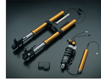
Suzuki Advanced Electronic Suspension (SAES)