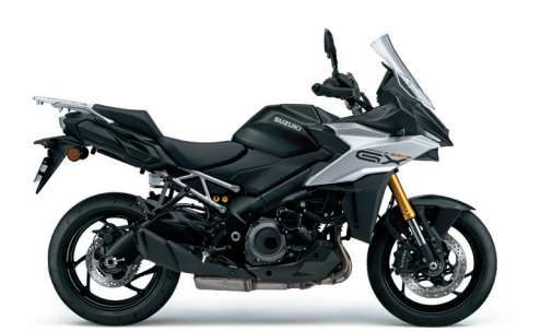
Pearl Mat Shadow Green (QU5)