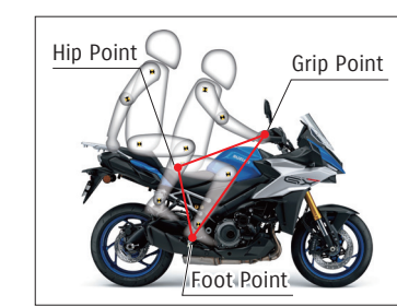
Comfortable Upright Riding Position