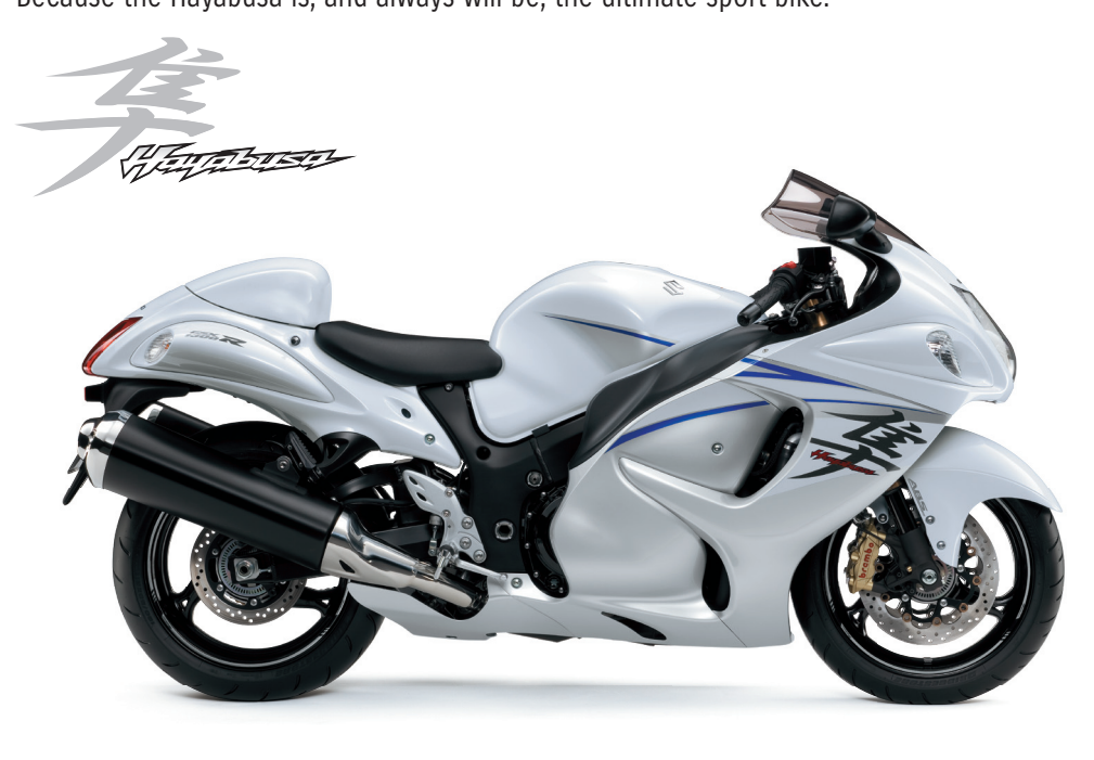
Pearl Bracing White / Metallic Mystic Silver (ARA)

Over the last decade, the motorcycle has evolved while staying true to its concept – the pinnacle of high-performance motorcycles. Its sensational power, speed, smooth ride and overwhelming presence continue to fascinate owners and onlookers alike. Because the Hayabusa is, and always will be, the ultimate sport bike.