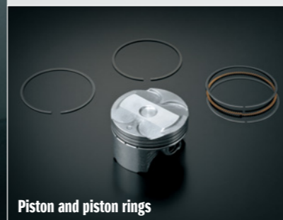
Piston and piston rings

The GSX-R125 features advanced electronic fuel injection, which delivers fuel based on what the rider is doing with the twist-grip throttle as well as input from sensors monitoring engine rpm, intake air pressure and temperature, exhaust oxygen content and coolant temperature. To improve intake efficiency, throttle response, and engine power throughout the rpm range, the GSX-R125 has a 32mm throttle body. A dual-spray, four-hole injector aims the spray from two holes directly at the intake valves. Ample intake air is supplied by a large-capacity airbox and efficient filter. The accurate electronic fuel injection system contributes to the GSX-R125's outstanding fuel consumption and economical operation.