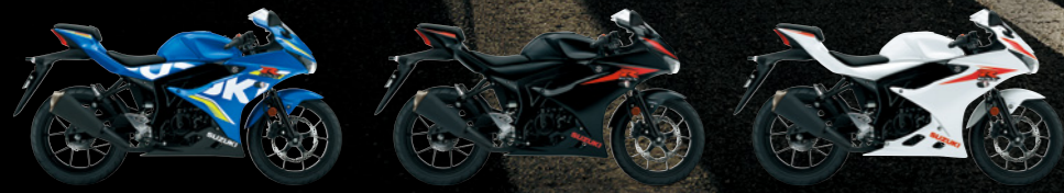
Metallic Triton Blue (YSF)