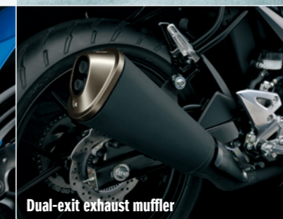
Dual-exit exhaust muffler