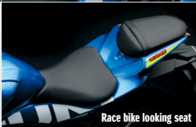
Race bike looking seat

The GSX-R125 has the smallest projected frontal area in the 125cm 3 class, which contributes to better acceleration, fuel economy, and cruising stability by reducing lift and drag. The GSX-R125's smooth, strong fairing and bodywork pieces not only look great, they are also lighter than the bodywork used by competitors.