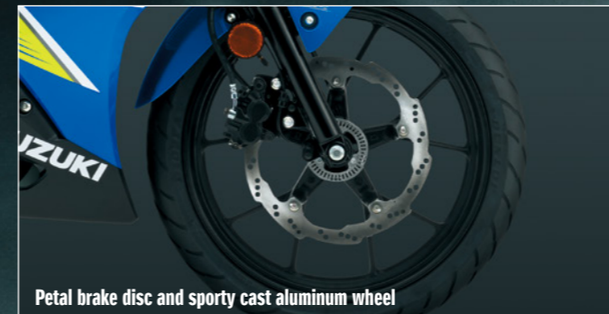
Petal brake disc and sporty cast aluminum wheel

The convenient easy start system automatically starts the engine with one touch of a button mounted on the handlebar; there's no need to hold the button down until the engine fires.