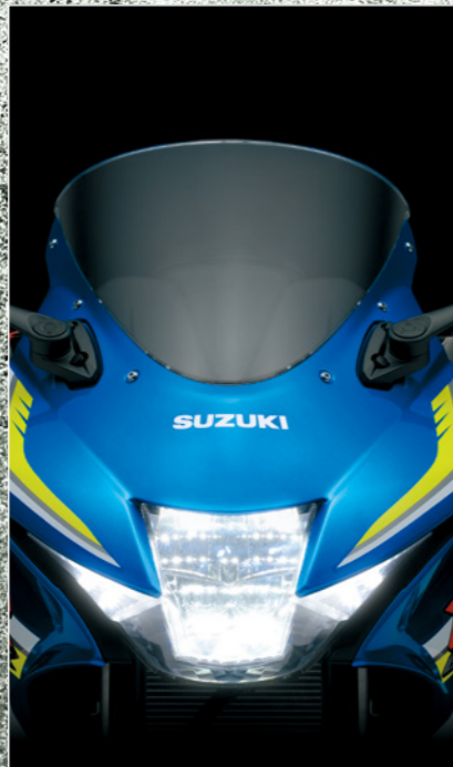
LED headlights and LED position lights