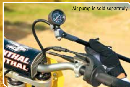
Air pump is sold separately.