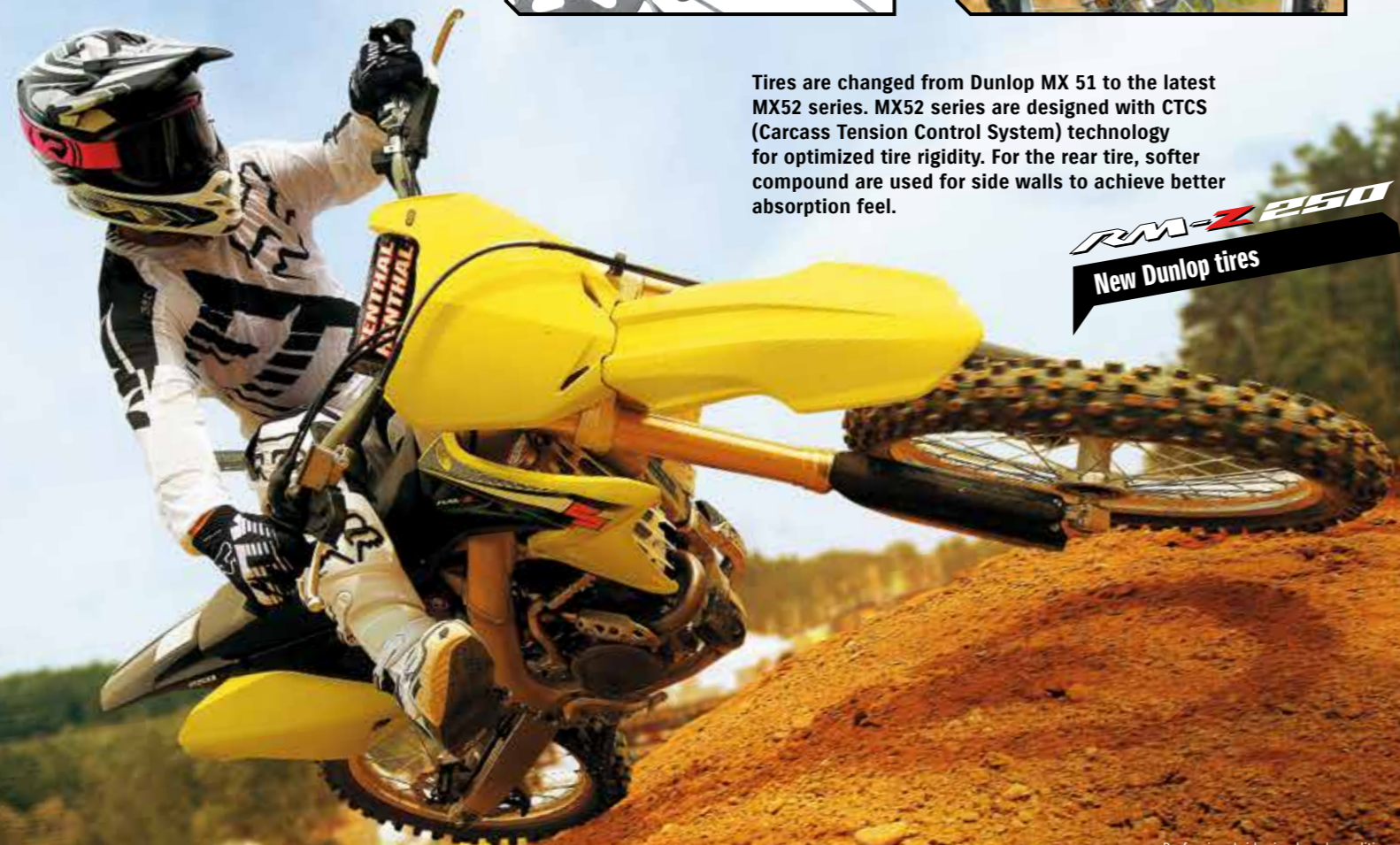
Professional rider in closed conditions