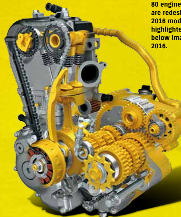
*Yellow highlighted parts are new for 2016.

To upgrade engine performance, more than 80 engine internal parts are redesigned for the 2016 model. The yellow highlighted parts in the below image are new for 2016.