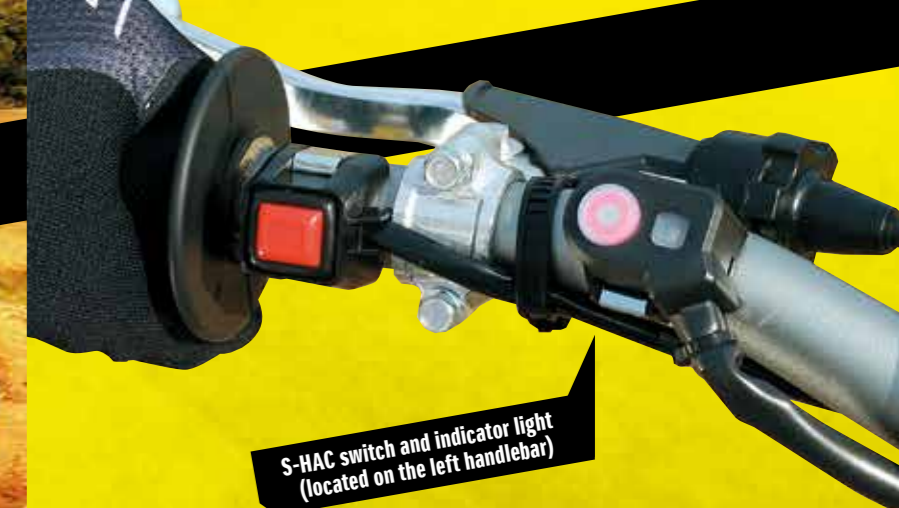
S-HAC switch and indicator light (located on the left handlebar)

Suzuki Holeshoot Assist Control (S-HAC) is a selectable launch mode system derived straight from factory race bike. S-HAC helps rider in launching from starting gate for an early lead. It was introduced in 2014 with RM-Z450, now it is standard equipment on RM-Z250 with more advanced, detailed control. The basic idea of Suzuki Holeshoot Assist Control (S-HAC) is as follows;