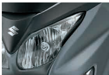
Metallic Mat Fibroin Gray (PGZ)