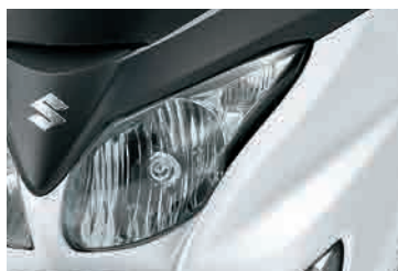
Brilliant White (YUH)