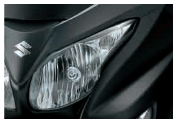
Metallic Mat Black No.2 (YKV)