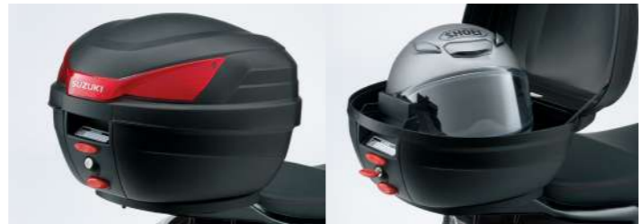
Plastic top case (27L)