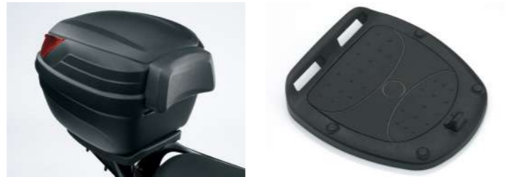
Cushion for top case