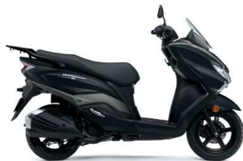
Metallic Mat Black No.2 (YKV)