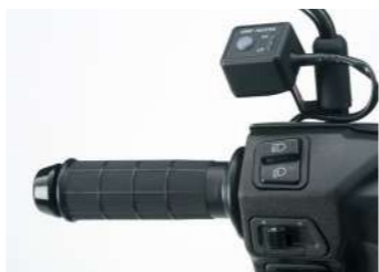
Grip heater set

Take advantage of genuine accessories to personalize your ride with additional comfort and convenience options to meet your needs and match to your style.