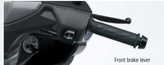
Front brake lever

*The Eco Drive Indicator does not automatically improve fuel economy but may help riders refine their riding efficiency and improve fuel consumption. Fuel consumption may vary depending on traffic conditions, such as the frequency of starts from stop, distance driven, rate of acceleration (throttle use), chosen speed, and maintenance.