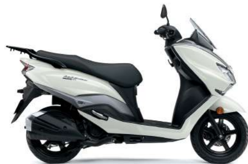
Pearl Mirage White (YPA)