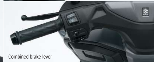
Combined brake lever