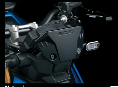
Enhances wind protection.