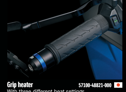
With three different heat settings.