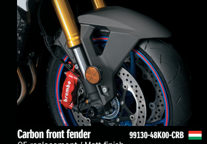
OE replacement / Matt finish.