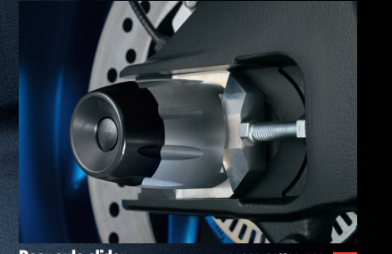
99116-48K00-000 Helps reduction of damage, made of aluminium

Please contact Suzuki Motor Corporation (SMC) for price, availability, ordering.