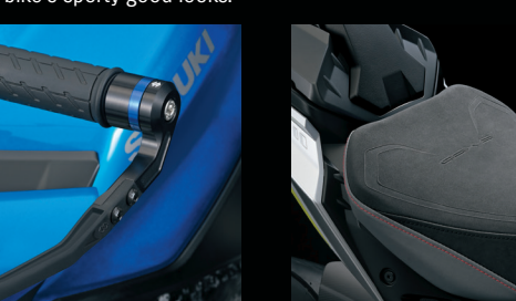
99153-48K00-000 Made of high-end billet aluminium and

Helps reduction of damage, made of aluminium