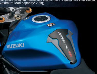
99180-48K10-GRY Fuel tank pad Fuel tank pad Please contact Magyar Suzuki Corporation (MSC) for price, availability, ordering. For tank scratch protection, features new GSX-S logo. For tank scratch protection, features new GSX-S logo. (Transparent)