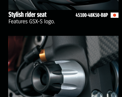
Front axle slider Helps reduction of damage, made of aluminium and ertacetal.