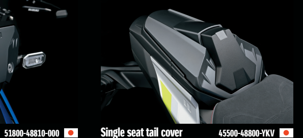
Enhances sporty image.