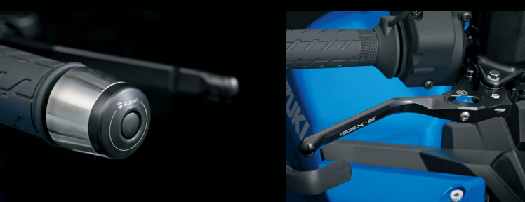
Billet brake lever (Anodized) 99150-46K00-000 Billet clutch lever (Anodized) 99151-46K00-000 Machined from high-end billet aluminum and decorated with the GSX-S logo, these black anodized levers enhance the bike's sporty good looks.