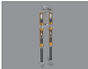
Showa coil-spring fork