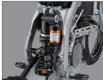
Traction control system

- Suzuki's MX-Tuner 2.0 is supplied, providing quick fuel injection and ignition tuning