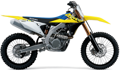
Champion Yellow No.2 (YU1)